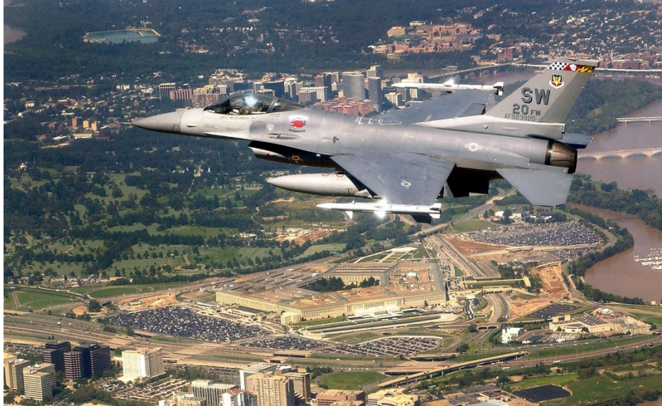
NORAD F-16 aircraft flies over the Pentagon in NOBLE EAGLE mission defending the homeland after 9/11.

Operation Noble Eagle response has become institutionalized into daily plans and NORAD exercises through which the command ensures its capability to respond rapidly to airborne threats. USAF units of NORAD have also assumed the mission of the integrated air defense of the National Capital Region, providing ongoing protection for Washington, D.C. Also, as required, NORAD forces have played a critical role in air defense support for National Special Security Events, such as air protection for the NASA shuttle launches, G8 summit meetings, and even Superbowl football events.