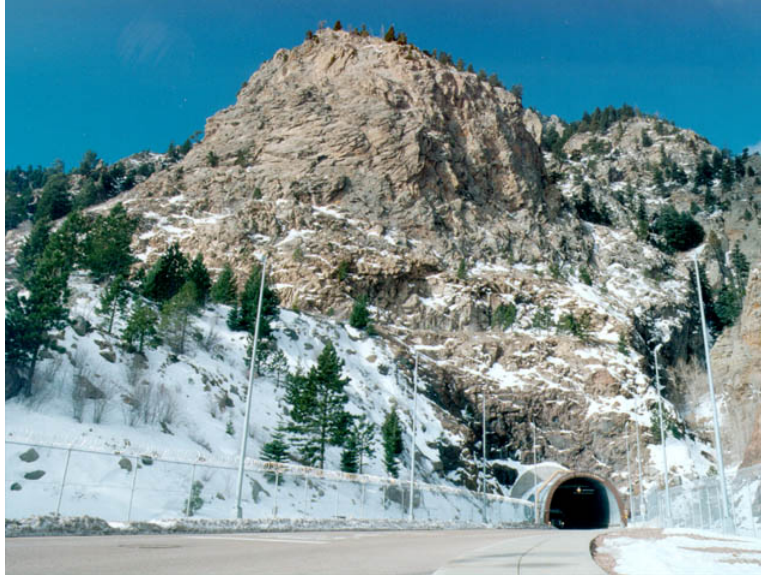
Cheyenne Mountain entrance, c. 1990s

Another example of NORAD's continuing adaptability also came in 2006. In NORAD's fifty-year history, perhaps the most notable symbol of the command has been the Cheyenne Mountain Operations Center (CMOC), often referred to as simply "Cheyenne Mountain." This vast bunker complex, which became fully operational in 1966, sat more than 1500 feet underground and consisted of fifteen buildings which comprised the central collection and coordination facility for NORAD's global-sensor systems. In early 2006, after studies and reviews, the NORAD and USNORTHCOM commander, decided, because of the changing nature of the threat in a post-9/11 world and because of gained efficiencies in monitoring the warning networks, the CMOC surveillance and warning of attack command centers could be relocated into a dual- purpose command center located at NORAD and USNORTHCOM headquarters on Peterson AFB. Cheyenne Mountain would become an alternate command center rather than be maintained on a 24/7 basis. The NORAD and USNORTHCOM Command Center at Peterson would become the official surveillance center for both commands, designed to give the commander and the Canadian and US leadership an accurate picture of any aerospace and other domain homeland threat.