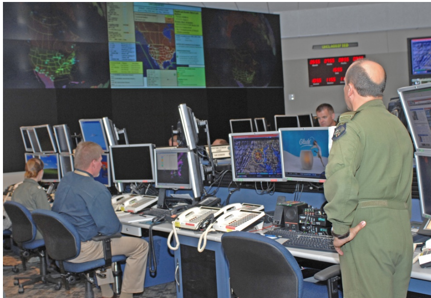
The NORAD and USNORTHCOM Command Center, May 2008.

defense and political leaders have therefore maintained the conviction that, for the foreseeable future, their common defense was best guaranteed by continued mutual cooperation.