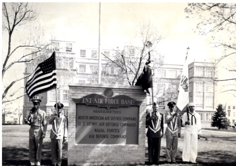
Headquarters, North American Defense Command, Ent AFB, Colorado Springs, CO.

With the beginning of the Cold War, American defense experts and political leaders began planning and implementing a defensive air shield, which they believed was necessary to defend against a possible attack by long-range, manned Soviet bombers. By the time of its creation in 1947, as a separate service, it was widely acknowledged the Air Force would be the center point of this defensive effort. Under the auspices of the Air Defense Command (ADC), first created in 1948, and reconstituted in 1951 at Ent AFB, Colorado, subordinate Air Force commands were given responsibility to protect the various regions of the United States. By 1954, as concerns about Soviet capabilities became more grave, a multi-service unified command was created, involving Naval, Army, and Air Force units—the Continental Air Defense Command (CONAD). Air Force leaders, most notably Generals Benjamin Chidlaw and Earle Partridge, guided the planning and programs during the mid 1950s. The Air Force provided the interceptor aircraft and planned the upgrades needed over the years. The Air Force also developed and operated the extensive early warning radar sites and systems which acted as “trip wire” against air attack. The advance warning systems and communication requirements to provide the alert time needed, as well as command and control of forces, became primarily an Air Force contribution, a trend which continued into the future as the nation’s aerospace defense matured.