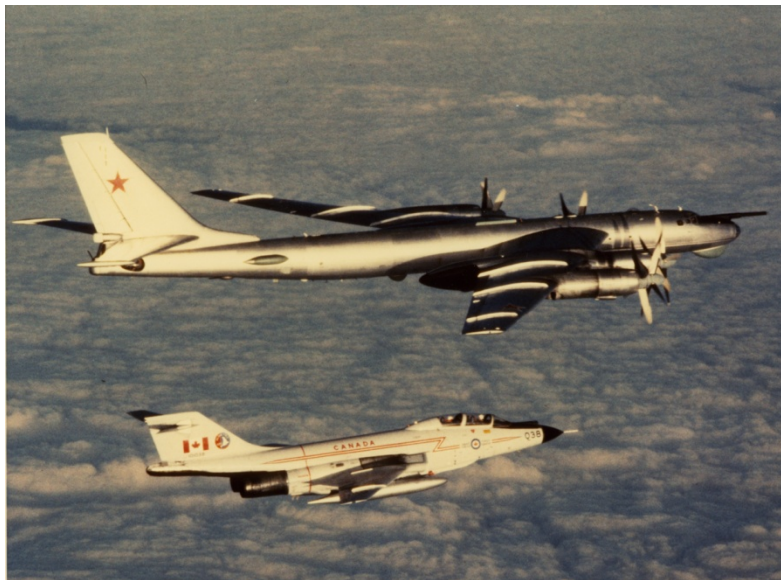
Canadian CF-101 Voodoo intercepts Russian TU-95 Bear Bomber flying near the North American airspace buffer zone.

Within one year of its establishment, NORAD began the process of adapting its missions and functions to “a new and more dangerous threat.” During the 1960s and 1970s, the USSR focused on creating intercontinental and sea-launched ballistic missiles and developed an anti-satellite capability. The northern radar-warning networks could, as one observer expressed it, “. . . not only [be] outflanked but literally jumped over.” In response, the USAF built a space-surveillance and missile-warning system to provide worldwide space detection and tracking and to classify activity and objects in space. When these systems became operational during the early 1960s, they came under the control of the NORAD.